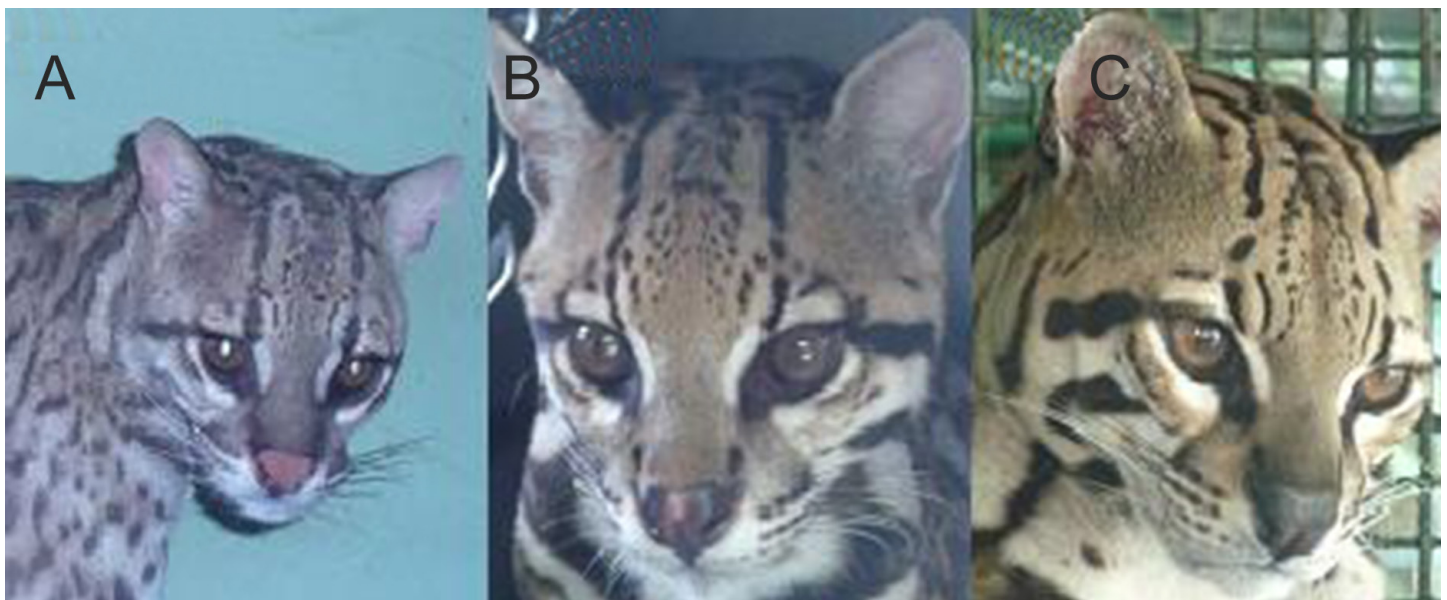
Fig. 2. A. Venezuelan ocelot with pink nose housed at Serpentarium. B. Venezuelan ocelot with mixed nose colour housed at Serpentarium. C. Trinidadian ocelot with black nose housed at EVZ.