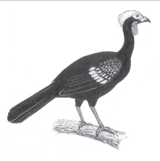
Trinidad piping-guan or pawi