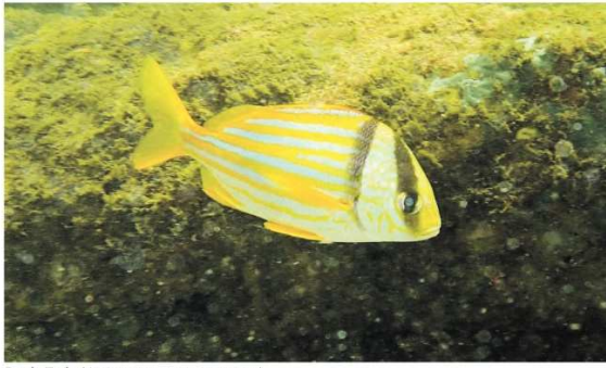
Pork Fish ( Anisotremus virginicus )

This native is a relative to the ornamental anthuriums grown in shade houses around the island. However, it has a relatively drab bloom.