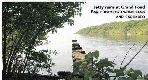
Jetty ruins at Grand Fond Bay.