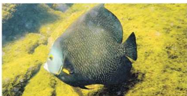
French Angelfish ( Pomacanthus paru ).

These beauties are a favourite of divers and are also at home in the