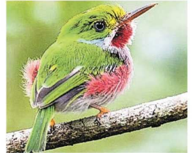
The Cuban Tody is another of the island's endemic species.

info on our natural environment, contact the Trinidad and Tobago Field Naturalists' Club at admin@ttfnc.org or visit our website at www.ttfnc.org and our Facebook or YouTube pages. The club's next monthly meeting is on October 12 at St Mary's College, Port of Spain.