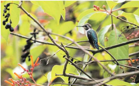
The Bee Hummingbird is the world's smallest bird. It is only found in Cuba.