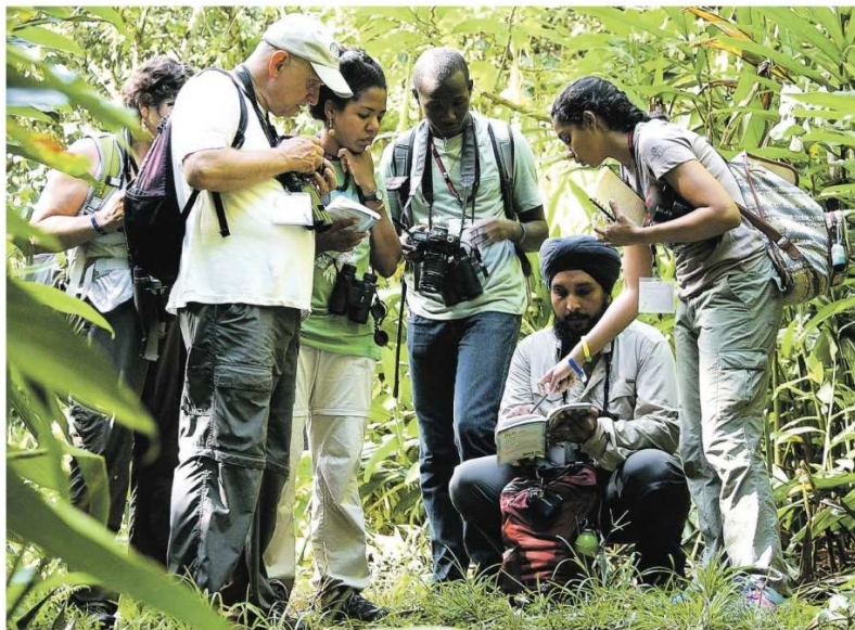
Some of TT's bird watchers at the BirdsCaribbean Conference in Cuba.

and round-table discussions, participants continued to explore themes that are unique to the Caribbean. There were sessions highlighting how migratory birds rely on the region, the fragility of Caribbean forest and wetland