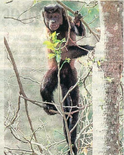
THE TUFTED capuchin, Cebus apella , is an introduced primate that has spread throughout the peninsula. It should not be confused with the native white-fronted capuchin, Cebus albifrons .