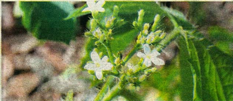
THE DEVIL nettle, Cnidoscolus urens is a plant to be wary of. It is covered with stinging hairs that, upon contact with the skin, release a potent irritant. It is common along the Pt Gourde trail.

FOR more information on our natural environment, you can contact the Trinidad and Tobago Field Naturalists' Club at admin@ttfnc.org or visit our website at www.ttfnc.org .