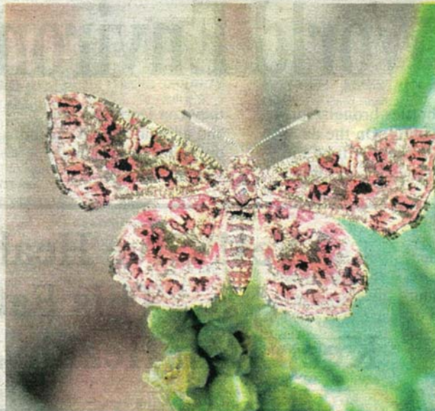
THIS butterfly is a female Calydna venusta . It is a rarely seen resident of the north-west peninsula.