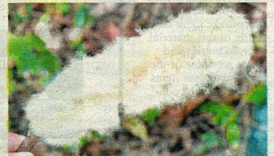
WHEN RIPE, the seedpods of bois flout, Ochroma pyramidale split open to expose their seeds. Seeds are transported by wind, thanks to the cotton-like fibres that surround them.