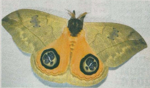
THIS bullseye moth ( Automeris liberia ) uses bright colours and alarming eyespots to protect itself.

During the night, light traps were set-up for surveying moths in the forest behind the beach. This bullseye moth ( Automeris liberia ) was one of many interesting species that we recorded. Normally concealed by the brown forewings, the bright orange hindwings and eyespots are exposed when the moth feels threatened, in order to scare off potential predators.