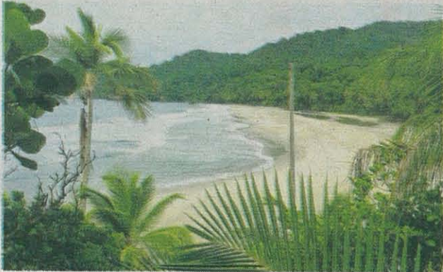
GRAND TACARIBE is a nature lovers' dream.

THE Trinidad and Tobago Field Naturalists' Club over-nighted at Grand Tacaribe on the north coast of Trinidad during the month of August. This secluded bay is a nature lover's dream. It is fringed by coconut trees which quickly give way to tropical forests. The seas are rough but shorelife is abundant. The Club visits Grand Tacaribe annually.