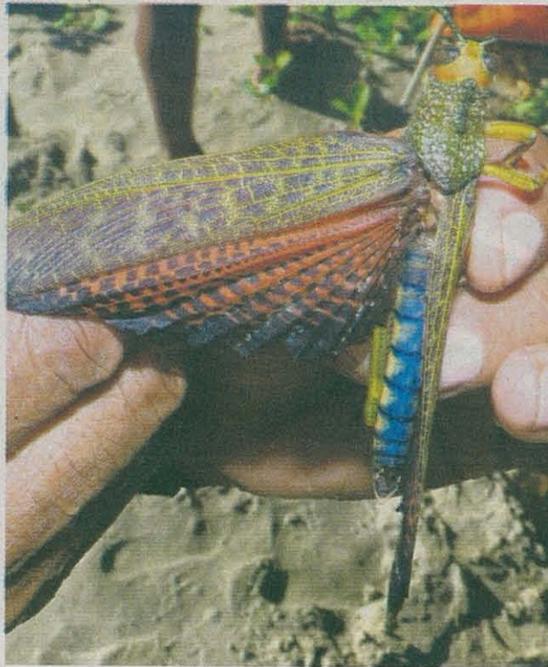
THIS grasshopper ( Tropidacris cristata ) has beautiful red wings and a blue abdomen.

Another beautiful insect we encountered was the giant red winged grasshopper ( Tropidacris cristata ). The red wings are only visible when extended, usually only when the grasshopper is in flight. This might be another example of using bright colours to discourage predators, like birds, which attempt to capture them. These grasshoppers are partial to feeding on coconut leaves which are plentiful at Grand Tacaribe.