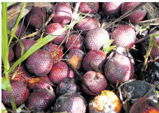
THE FRUIT of the moriche palm.