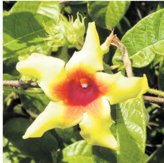
THE beautiful savanna flower (Mandevilla hirsuta).