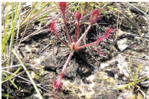
THE BIZARRE sundew captures small insects for additional nutrition.

THE TRINIDAD and Tobago Field Naturalists' Club (TTFNC) visited the Aripo Savanna Scientific Reserve in September. This unique area is one of the few remaining natural savanna ecosystems in Trinidad. It is characterised by low, scrubby vegetation, waterlogged soils and open grasslands. It was declared an Environmentally Sensitive Area in 2007.