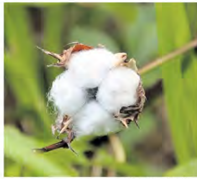
SEA island cotton.