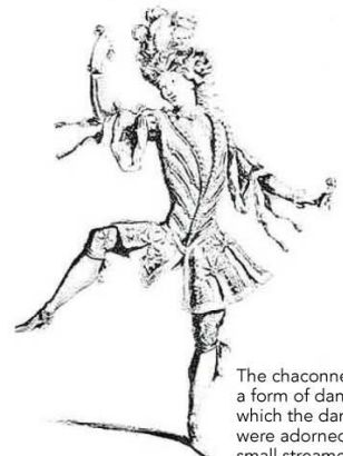
The chaconne was a form of dance in which the dancers were adorned with small streamers.

Around this time of FLAME continues on Page 4B