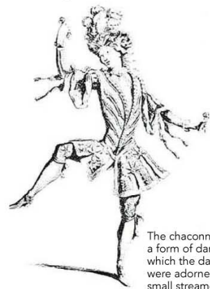
The chaconne was a form of dance in which the dancers were adorned with small streamers.

Around this time of FLAME continues on Page 4B