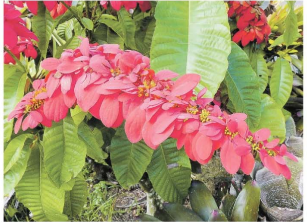
The double chaconier has more sepals than single chaconier. It is unique to Trinidad.

Firstly, it is widely publicised at this time of year that our na-