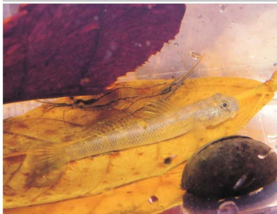
A RIVER GOBY ( Sicydium sp)