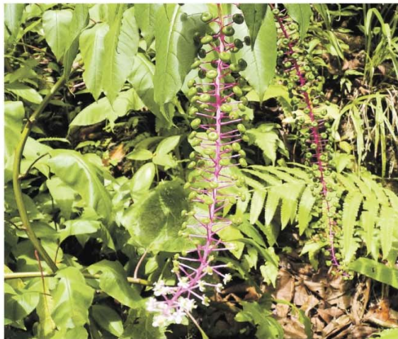
THE Z'OI MILLAT ( Phytolacca rivinoides )