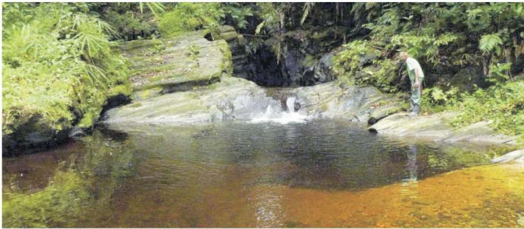
A FOREST pool at Rincon.