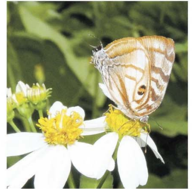
METON HAIRSTREAK ( Rekoa meton )

At this time of year, many plants are in bloom and several butterflies could be found at roadside clumps of the railway daisy ( Bidens pilosa ) as we made our way back out the trail. One of these was the meton hairstreak ( Rekoa meton ). Hairstreaks are an interesting family of