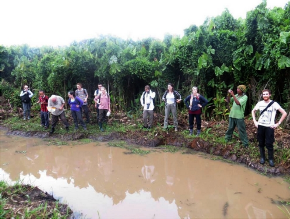
The herpetology group/University of Glasgow gets down and dirty in Los Blanquiales.

Not to be outdone, the art group visited the Pointe-a-Pierre Wildfowl Trust for a day of drawing, painting, photographing and just enjoying what the environment had to offer.