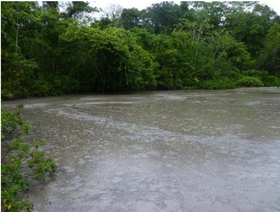
The rains come down at the Lagoon Bouffe tassik.

Lagoon Bouffe was the destination for the May field trip which featured a short walk to the tassik. This lake of mud had members puzzling over the appearance of dead fishes and mysterious animal tracks before the rain came down in force.