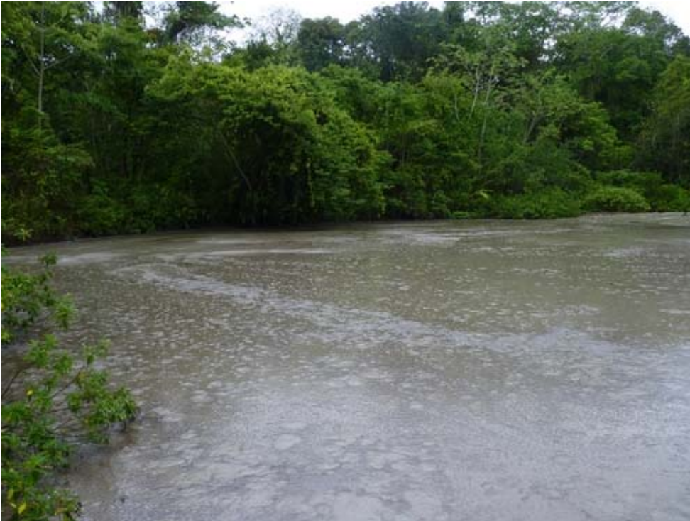
The rains come down at the Lagoon Bouffe tassik.

Lagoon Bouffe was the destination for the May field trip which featured a short walk to the tassik. This lake of mud had members puzzling over the appearance of dead fishes and mysterious animal tracks before the rain came down in force.