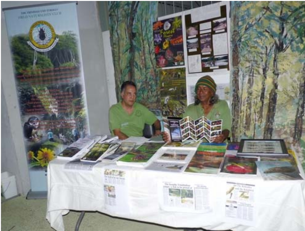
The Club display at the Horticultural Society show.

The Club participated in the Horticultural Society's annual flower show at the Queen's Park Savanna from 10 th May to 1 st June. The three day event drew lots of curious onlookers as a range of printed material was on display.