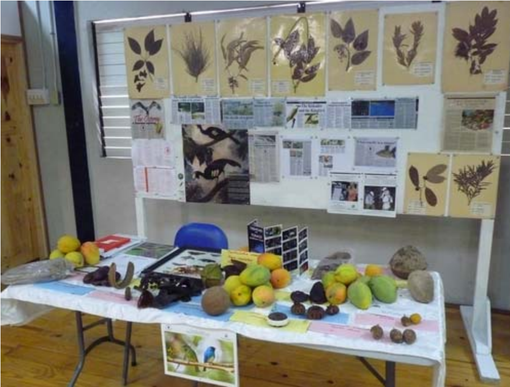
The Club display at the T&T Orchid Society show.