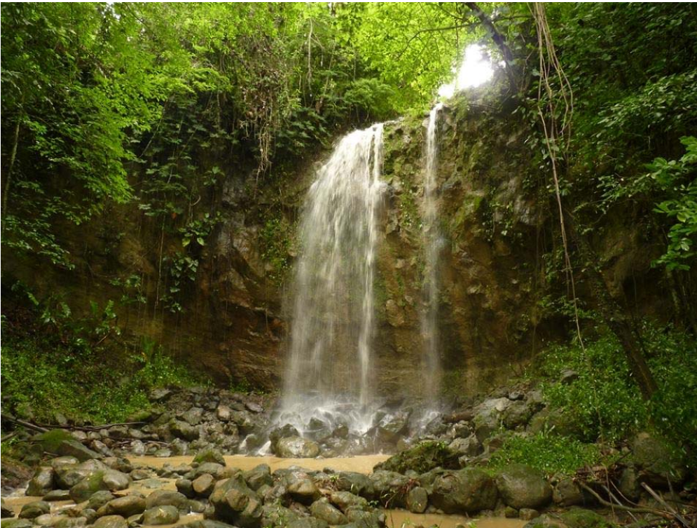
Waterfall at Brasso Venado

The July field trip was to Brasso Venado in central Trinidad where members visited the Doppler Radar Station and a waterfall.