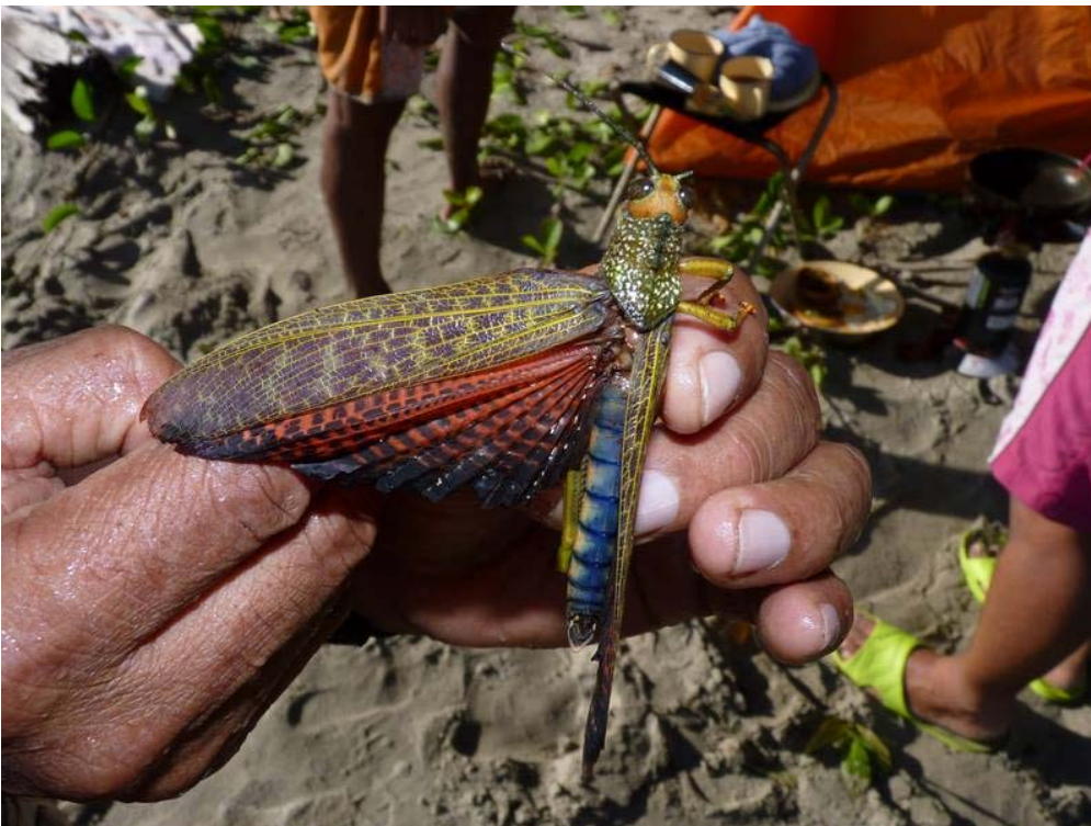
Giant red-winged grasshopper ( Tropidacris cristata )