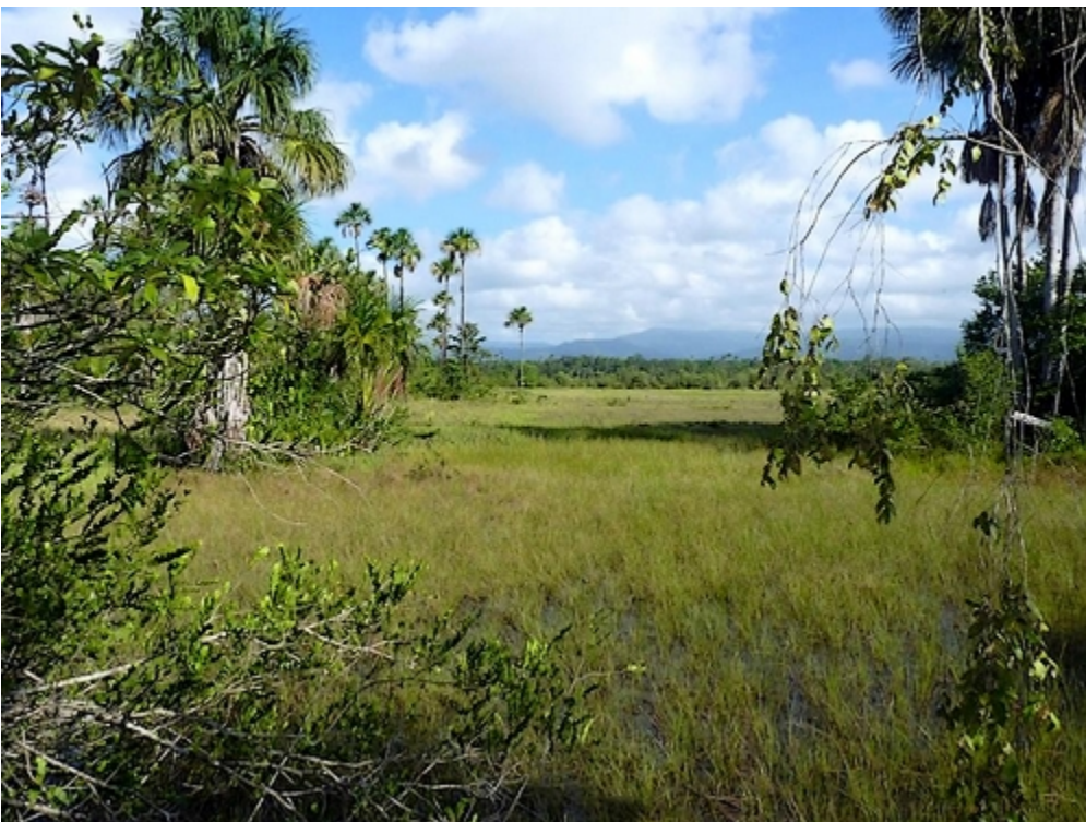
The Aripo Savannas

The bird group visited the Caroni wetlands in September while the main field trip was to the Aripo Savannas where a range of unique plants and animals were observed.