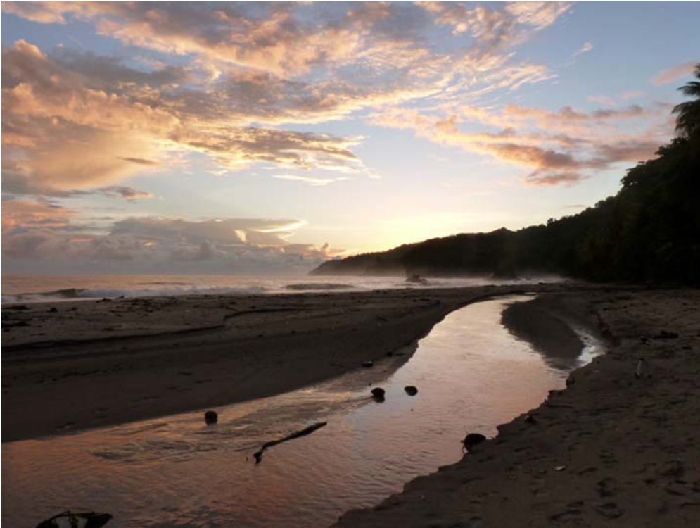
Sunrise on Grand Tacaribe

August's field trip was the traditional overnight stay on Grand Tacaribe. Members has fantastic trip and surveys on moths, butterflies and arthropods of significance to human health were conducted (a report will be presented in QB3 2014).