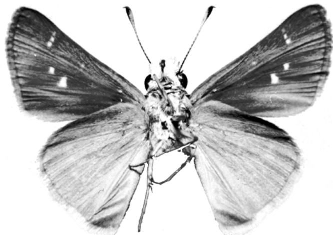
Fig. 3. Lerodea eufala eufala (male) UNS of plate 3. The darker tone in spaces 6 and 7, and at the tornus UNH are shadows due to the positioning of the camera flash; the UNH is rather uniformly pale brown.