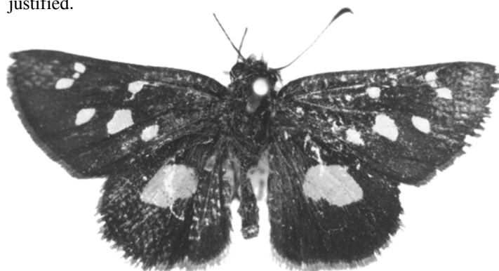
Fig. 1. Dalla ? quasca , St. Ann's, x-xi.1920, A. Hall (specimen in Booth Museum)

This is a genus of predominantly high altitude butterflies, and the presence of D. quasca in Trinidad seems unlikely. It is possible that this specimen is mis-labelled. For example, Stalactis susanna Fabricius is a large and brightly coloured riodinid restricted to central and southern Brazil and perhaps Paraguay (D'Abrera 1994), yet there is an A. Hall specimen in the Booth Museum labelled St. Ann's, xi-xii.1931 which must surely be mis-labelled. On balance, the retention of this species on the Trinidad list does not seem justified.