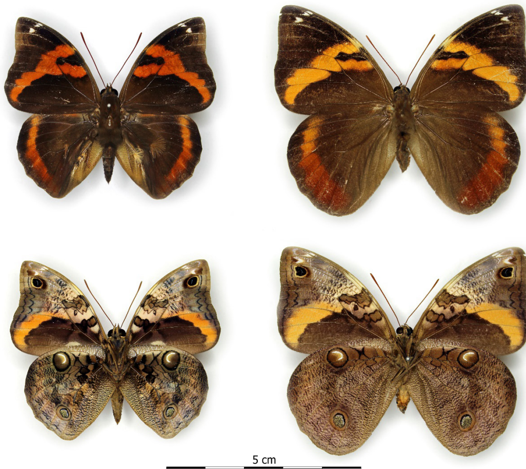
Fig. 1. Opsiphanes cassina merianae , male left, female right, dorsal view above, ventral view below. Male: Brigand Hill summit, at dusk, 28 March 2013; female, Curepe, fruit trap, 25 September 1980.

Having examined a series of pinned specimens of the