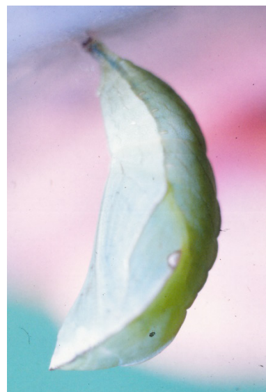
Fig. 7. Pupa of Opsiphanes cassina merianae , St. Augustine, collected as caterpillar on ornamental palm, October 1981, 26mm.

photographed by Rainer Deo (Fig. 6). The caterpillars of both species have twin caudal spikes, longitudinally striped green bodies and pale grey-brown heads with distinctive backwardly-projecting, black-tipped, orange-brown horns on the heads (Figs. 5-6). Opsiphanes cassiae cassiae has three conspicuous pairs of such horns, the subdorsal and dorsolateral pairs being long, but the lateral pair short (Fig. 6), whereas O. cassina merianae only has the subdorsal horns long with a black tip (Fig. 5). In addition, O. cassina merianae has a double orange line down the centre of the