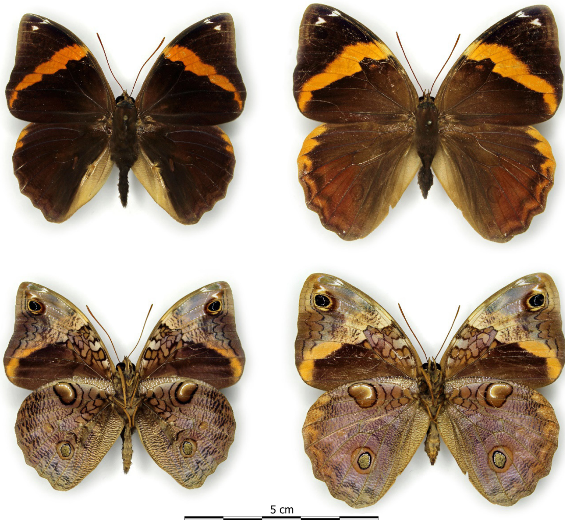
Fig. 2. Opsiphanes cassiae cassiae , male left, female right, dorsal view above, ventral view below. Male: St. Benedict's, fruit trap, 17 May 1982; female, as male 13 May 1982.