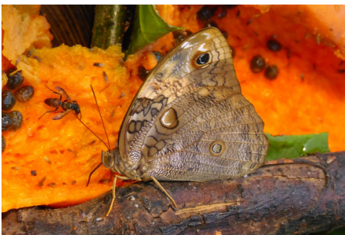
Fig. 4. Opsiphanes cassiae cassiae , female. South Oropouche, Mondesir, 5 December 2019, Tarran P. Maharaj.