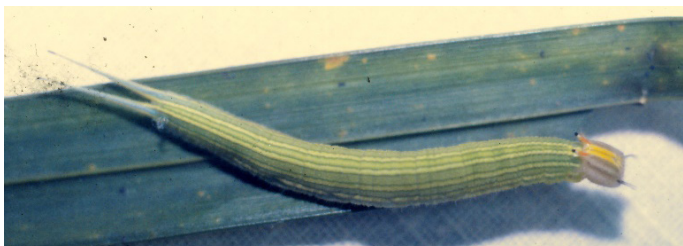
Fig. 5. Caterpillar of Opsiphanes cassina merianae , St. Augustine, on ornamental palm, October 1981, 65mm.