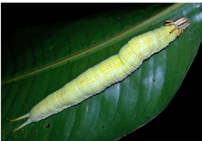
Fig. 6. Caterpillar of Opsiphanes cassiae cassiae , Inniss Field, on Heliconias sp., 2 August 2019, R. Deo. https://www.inaturalist.org/observations/30270859 with permission.

photographed by Rainer Deo (Fig. 6). The caterpillars of both species have twin caudal spikes, longitudinally striped green bodies and pale grey-brown heads with distinctive backwardly-projecting, black-tipped, orange-brown horns on the heads (Figs. 5-6). Opsiphanes cassiae cassiae has three conspicuous pairs of such horns, the subdorsal and dorsolateral pairs being long, but the lateral pair short (Fig. 6), whereas O. cassina merianae only has the subdorsal horns long with a black tip (Fig. 5). In addition, O. cassina merianae has a double orange line down the centre of the