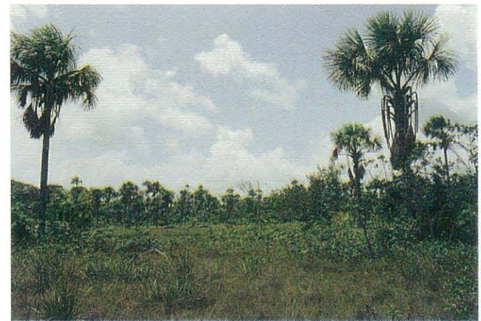
Plate 5: The gap between the Moriche palms in the foreground once contained trees which were destroyed by repeated fires. Grasses and sedges such as Paspalum pulchellum , Rhynchospora barbarta and Lagenocarpus rigidus , once established, favour the development of savanna.

Both the transition plots in Savanna V occur in areas where forest once extended in a narrow band across the landscape isolating smaller pockets of savanna from larger ones. Recurring fires eliminated the forest trees and opened a permanent gap, allowing the isolated pockets of savanna to coalesce with the main savanna (Plates 4 and 5).