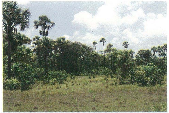
Plate 4: The north-west corner of Savanna V where expansion is taking place

The other transition plot in Savanna V, which is located in the north-west sector, has two abundant plants, Paspalum pulchellum and Rhynchospora globosa both of which are true savanna species. In addition to Paspalum , several tall grasses form a dominant herbaceous cover, Panicum cyanescens , P. parvifolium , Andropogon virgatus and A. leucostachyus , which seems to have slowed succession towards savanna. Hummocky microtopography characteristic of marginal areas, combined with high water tables, creates wet hollows where algae flourishes. The relict forest tree Mauritia flexuosa (Moriche palm) adapts to this wetness by producing pneumatophores.