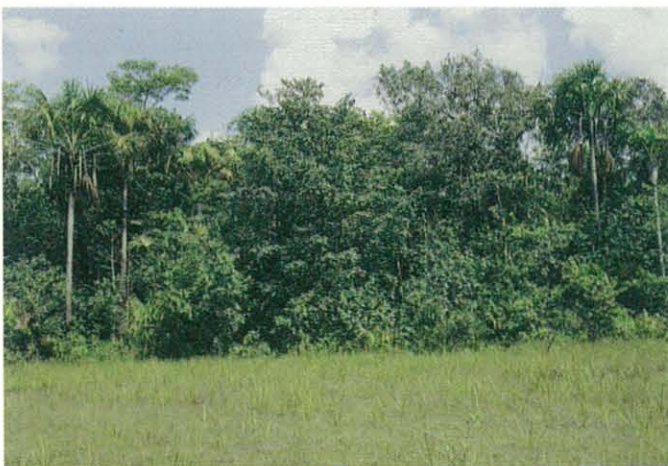
Plate 1: The sharp ecotonal boundary between mature marsh and savanna on the western side of Savanna VI

The most stable communities encountered during the survey were the marginal areas where the sharpest ecotones occur between forest and savanna, and the open savanna away from marginal disturbance. Sharp ecotones are not a common feature around any of the Aripo savannas reflecting