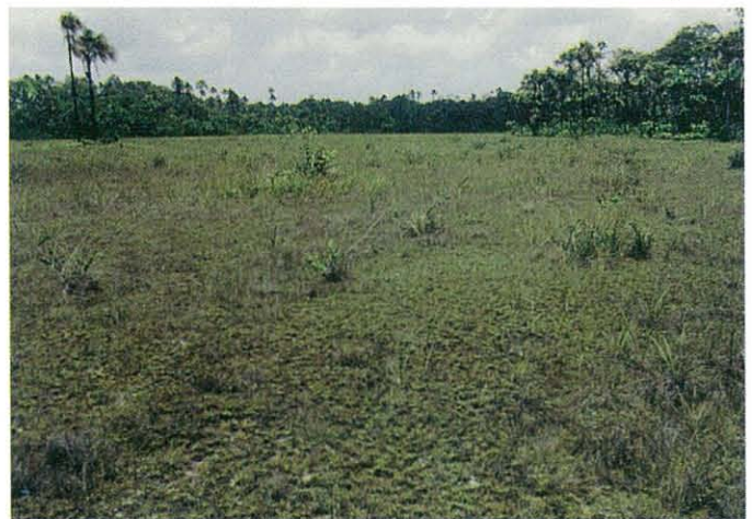
Plate 2: Treeless open expanse of Savanna V with stable ground cover dominated by grasses and sedges

In the open treeless savanna (Plate 2), which represents the other stable community, the ground cover is dominated by the sedges Rhynchospora curvula and R. barbata , the grass Paspalum puchellum and the insectivorous Drosera capillaris