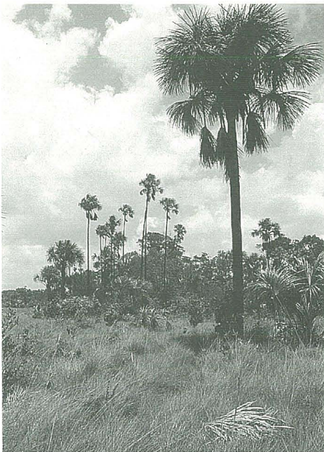
Plate 6: Savanna expansion has been slowed by the dominance of the tall grasses in the foreground, such as Panicum cyanescens , P. parviflorum , Andropogon virgatus and A. leucostachyus .

transition zones were compared with the control plots (see Table I). The transition plot in Savanna VI (TS6) which represents re-establishment of forest has 41% forest species and only 4.5% savanna species while the transition plot in the SE section of Savanna V (TS5S) which represents establishment of savanna has 9.5% forest species and 40.5% savanna species, a reversal of the trend in TS6. The transition plot in the NW section of Savanna V (TS5N) which represents arrested development of savanna has 14% forest species and 42% savanna species, percentages which show similarities to those for TS5S. The trends are what would be expected from the observed general patterns. The three transition plots (TS6, TS5S, TS5N) also have the highest percentages of marginal and disturbance species compared with the control plots, namely FS6E, FS6W and OS5 (see Table I). In fact, the two forest/savanna control plots of VI have no disturbance species while the open savanna plot of V has no marginal species. This reinforces the validity of the controls.