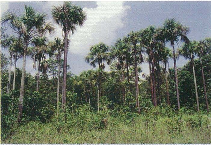
Plate 3: A diffuse margin on the western side of Savanna VI where relict Moriche palms are the only marsh forest trees to have survived the fire damaged habitat. Shrubs beneath the palms, such as Ilex arimensis (Biscuitwood) and Iserfia parviflora (Wild ixora) are good indicators of the re-establishment of forest.

disturbance while the Heliconia is an invasive weed. Mauritia flexuosa (Moriche palm) was the only mature tree (Plate 3) indicating its ability to withstand fire as there was evidence of burning in and around the plot. Once the canopy is opened up by fire, the increased light produces a dense mid-story herbaceous layer made up mainly of sedges ( Diplacrum longifolium , Lagenocarpus guianensis and Scleria ) that allow little light penetration to the ground. In well-shaded areas, beneath shrubs and immature trees, forest species such as the woody vine Rourea surinamensis , and Maprounea guianensis (Petite-feuille) gain a foothold.