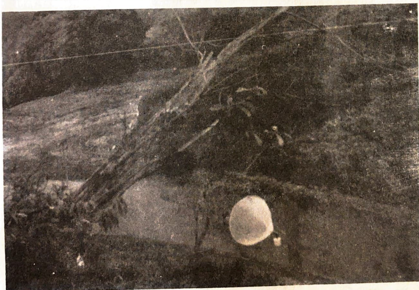
Wind Trap No. 2 on the north face of the road cutting, viewed from above.