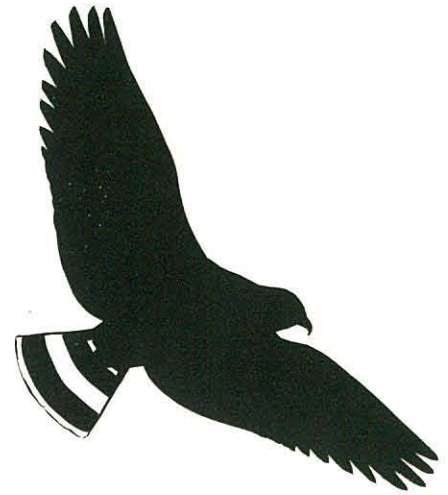
Common Black Hawk ( Buteogallus anthracinus cancrivorus )