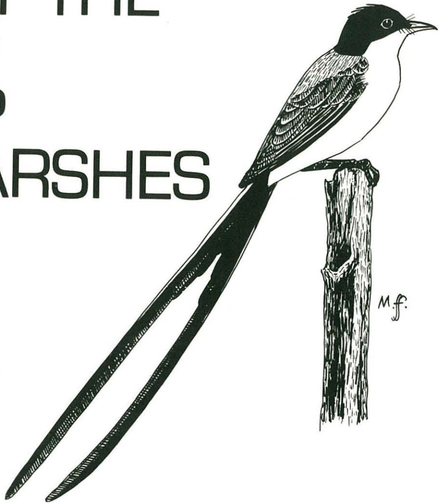
Fork-tailed Flycatcher ( Muscivora tyrannus tyrannus )