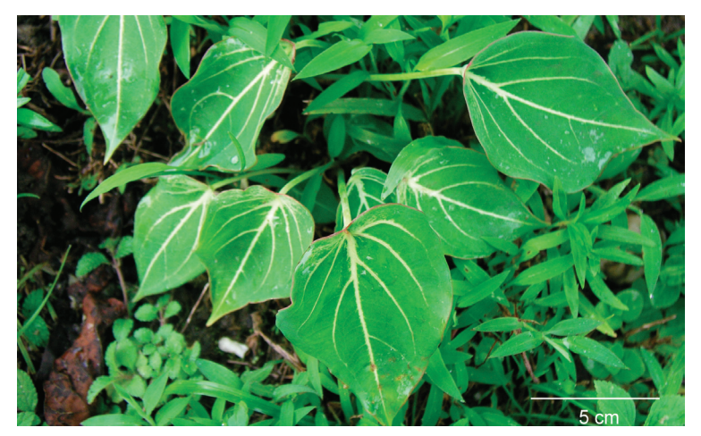
Fig. 3. Caladium schomburgkii growing near Matura.