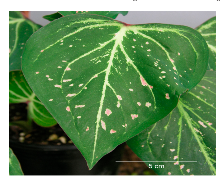
Fig. 4. A leaf of Caladium schomburgkii of the type growing along the Paria-Morne Bleu Road.