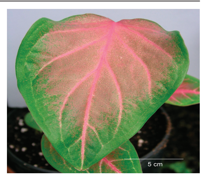
Fig. 2. A leaf of Caladium schomburgkii of the type growing in cultivation at Vega de Oropouche.