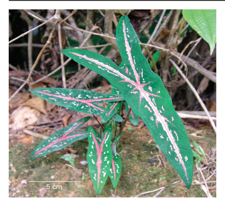
Fig. 1. Caladium picturatum growing along Lalaja Trace.