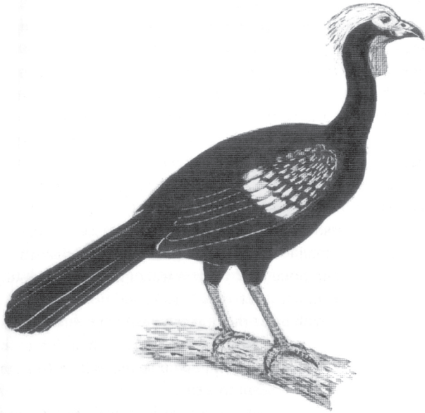
Trinidad piping-guan or pawi