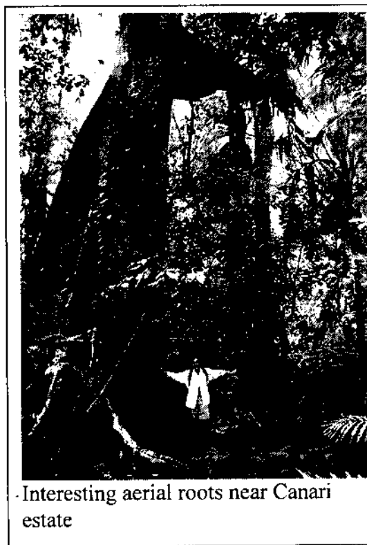
Interesting aerial roots near Canari estate

The tide was out at Canari Bay so the expanse of flat sandy beach was sizeable, about 400m wide by about 30m deep. The high water mark however was about 3m from the steep slope making the beach almost nonexistent when the tide was in and I wondered if this beach would exist in another 10 years, even at low tide. Rising seas due to global warming were a real threat to beaches such as this.