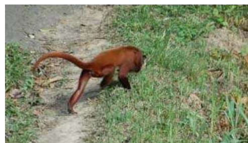
Red Howler Monkey on the ground

The mud volcanoes' "bubbles" are caused, not by heat, but by gases that leak out into the mud through a fault below. The gases, we were told, are comprised of mostly methane (86%) with a lower concentration of nitrogen and carbon dioxide. The mud itself is essentially clay saturated with salt water. The attending cosmetic expert claimed that it had redeeming effects on the skin, not to mention a number of health benefits, with preventatives of sicknesses from cancer to arthritis (And surely enough, before leaving the volcanoes, I had the mud streaked across my face courtesy my fellow field naturalists, Alyssa). The clay content of the mud meant that, when partially dried, it