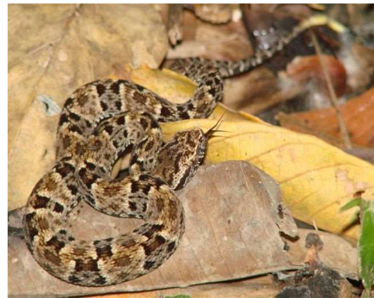
Mapepire Balsain Nariva

Cornbirds chirped merrily all around as we, with our shoes and pants heavily laden with mud, followed our path through a thicket of roseau ( Bactris Majors ). These hideously thorny trees thrive in acidic soil and are related to coconut, with a similar, albeit much smaller, (approximately 1½ inches)