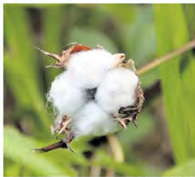
SEA island cotton.