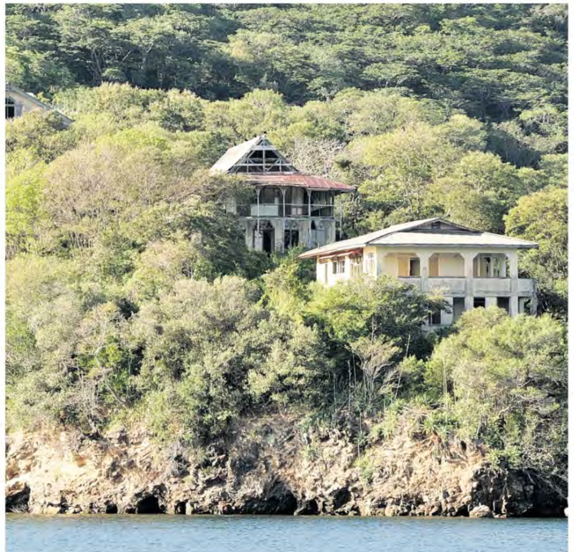
ABANDONED leprosarium buildings

EDUCATION FOR EMPLOYMENT, ENTREPRENEURSHIP AND ECONOMIC DEVELOPMENT