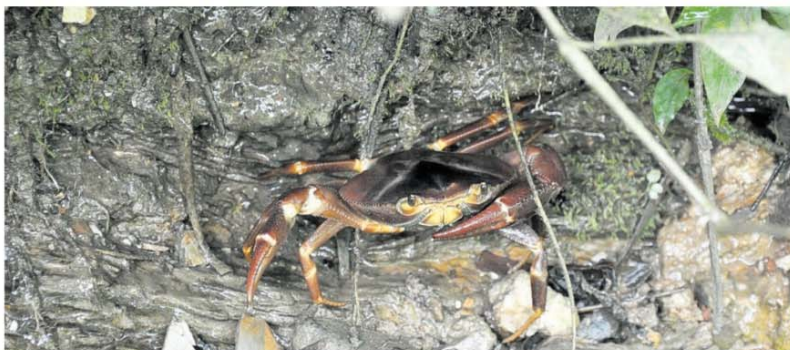
THE manicou crab.