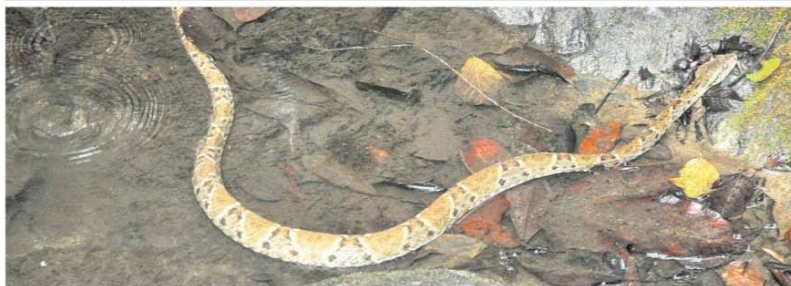
THE mapepire balsain or fer-de-lance.